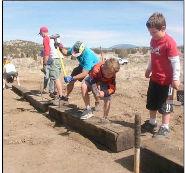
Fifty railroad ties were unloaded, drilled, and staked into the ground

Litrell coordinated the event with the two groups and the BLM. The actual workday was a tremendous success. Fifty railroad ties were unloaded, drilled, and staked into the ground with lengths of rebar in under two hours. It was a gorgeous day and folks quickly saddled up for a ride in the Pine Nuts, sweetened with the knowledge that they are participating in improving the experience for other outdoor enthusiasts. The improvements at the tree are approved by the BLM, and help strengthen and validate the use of public land for recreation. Thanks to AACC, PNMTA, and all the people that showed up to help!