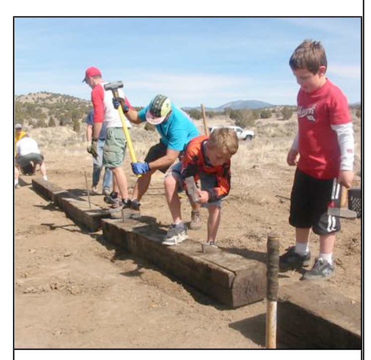
Fifty railroad ties were unloaded, drilled, and staked into the ground

Litrell coordinated the event with the two groups and the BLM. The actual workday was a tremendous success. Fifty railroad ties were unloaded, drilled, and staked into the ground with lengths of rebar in under two hours. It was a gorgeous day and folks quickly saddled up for a ride in the Pine Nuts, sweetened with the knowledge that they are participating in improving the experience for other outdoor enthusiasts. The improvements at the tree are approved by the BLM, and help strengthen and validate the use of public land for recreation. Thanks to AACC, PNMTA, and all the people that showed up to help!