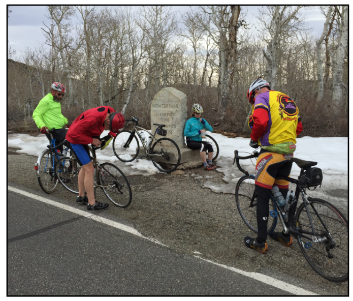
Weekend ride to the top of Monitor on March 15