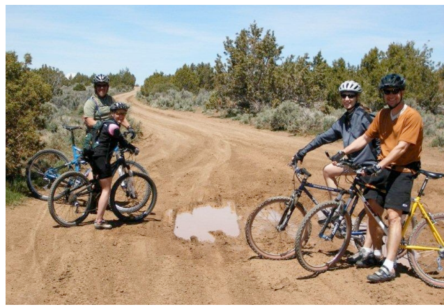
Out in the Pine Nuts