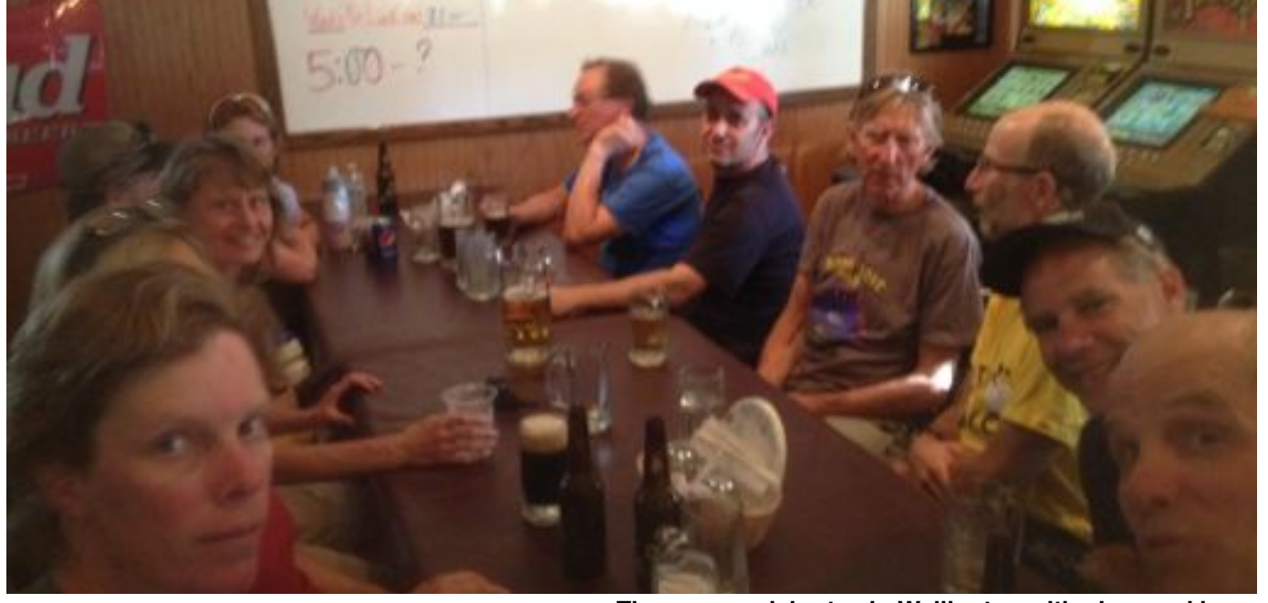
The group celebrates in Wellington with pizza and beer.