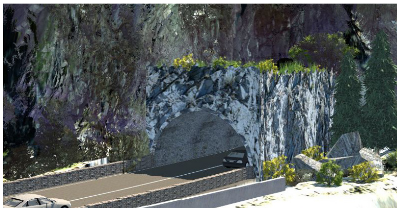
New concrete structure for southbound entrance