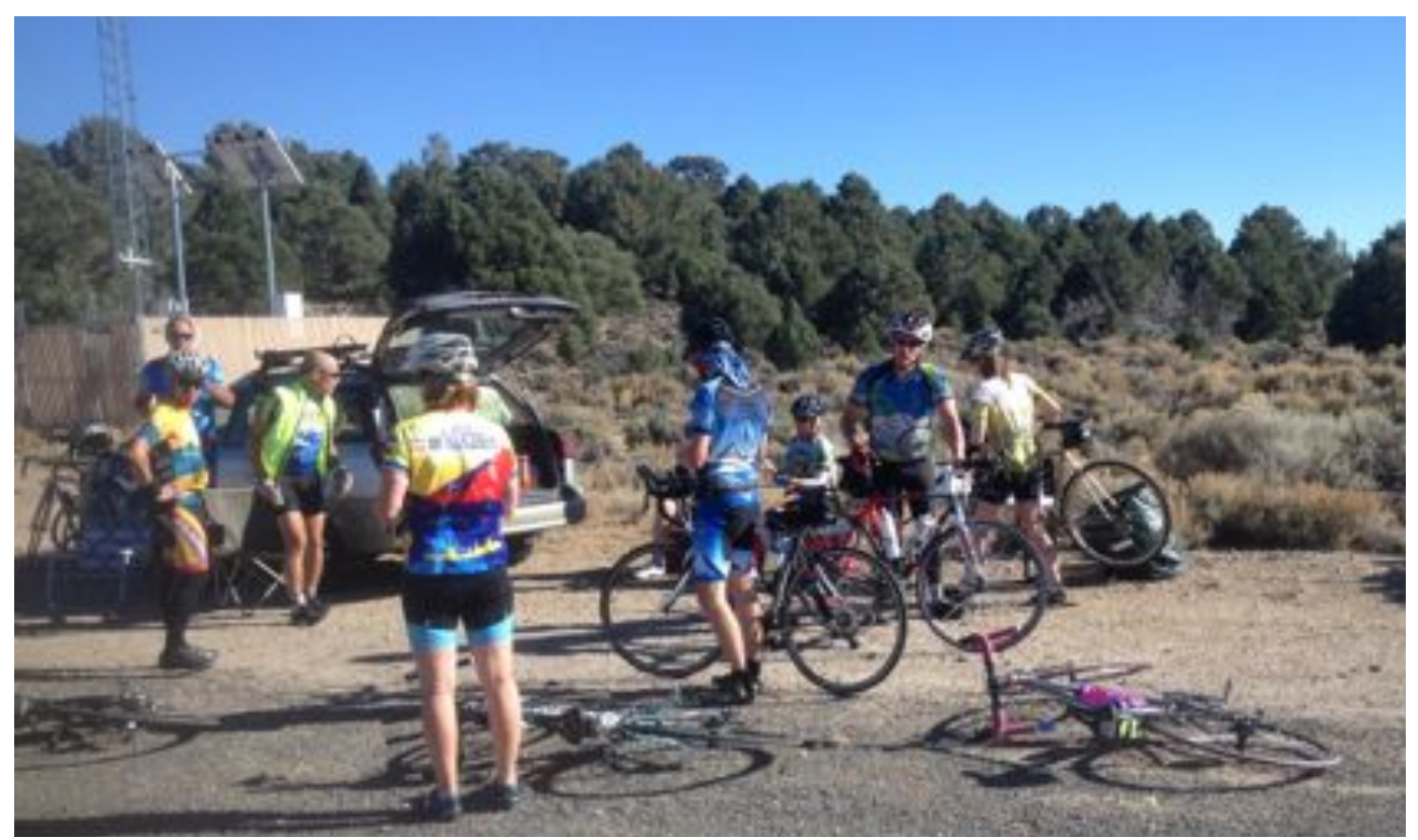
Socializing at the Sweetwater Rest Stop.