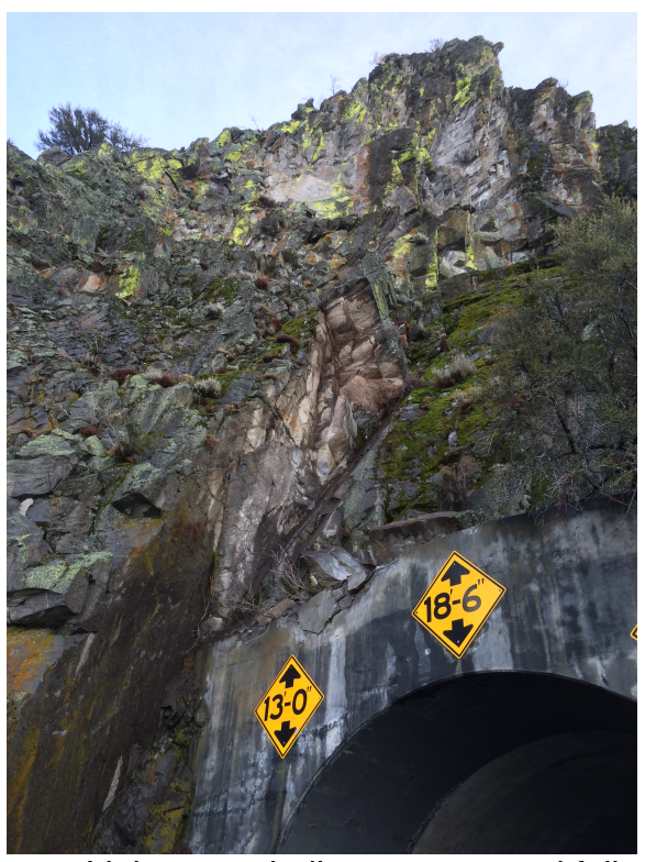
Light areas indicate recent rockfalls

While work proceeds, traffic on US50 will be restricted to one lane in each direction traveling through the east tunnel. Cycling through the tunnel during this period will be permitted but discouraged and the club will avoid scheduling any rides through this stretch of US 50.