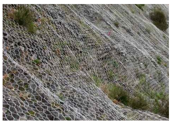
Temporary fencing being installed now