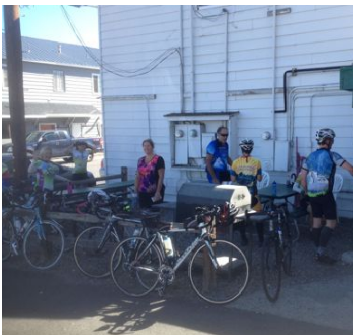
Riders at the turn-around in Bridgeport.