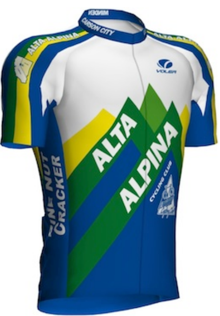
Club Jersey : Order online! Select the cut and size and you'll have your jersey in about two weeks: http://www.voler.com/browse/