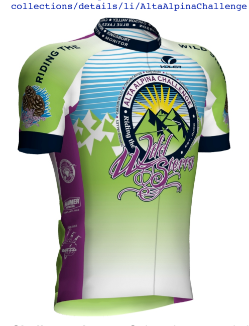
Challenge Jersey: Select the cut and size and you'll have your jersey in about two WeekS: http://www.voler.com/browse/collections/details/li/AltaAlpinaChallenge