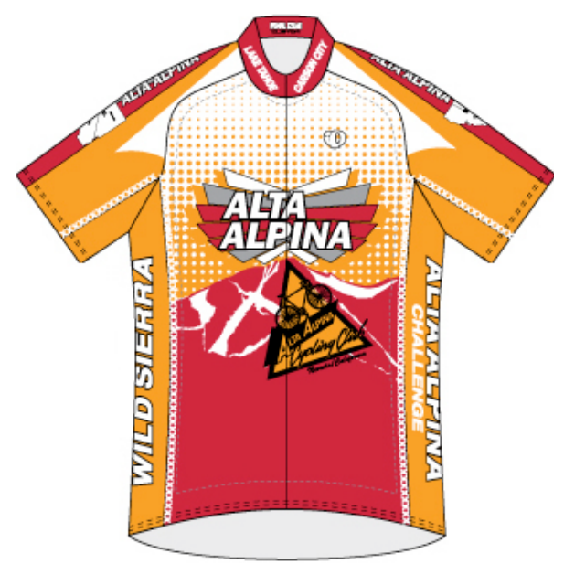
Red and Orange Jerseys : We have a limited inventory of items in this style. Contact Lori to check on availability.